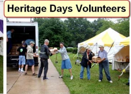
Heritage Days Volunteers