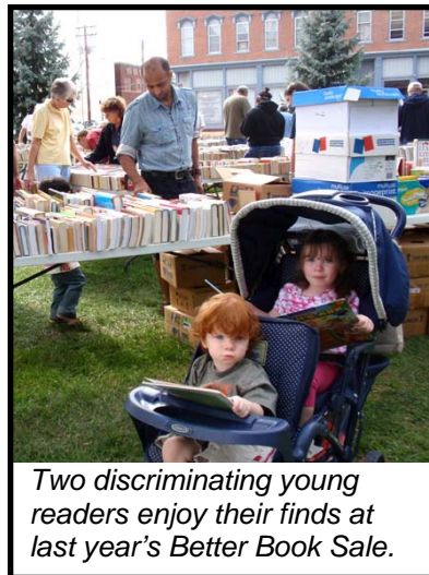
Two discriminating young readers enjoy their finds at last year's Better Book Sale.