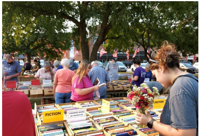
Shoppers enjoy finding the perfect book at the 2022 sale.